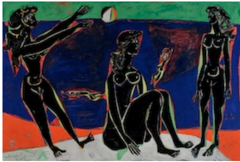
2 – Les Jeux de l'été / The Plays of Summer