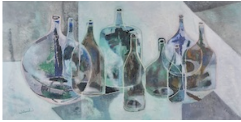
1 – Les neuf bonbonnes – Bourgogne / The nine Bottles – Burgundy