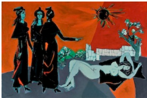
3 – Les Parques