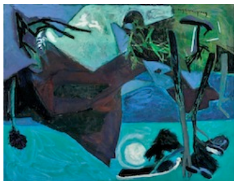
5 – La nuit à la Ciotat / Night in Ciotat